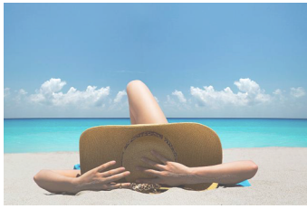
go to the beach